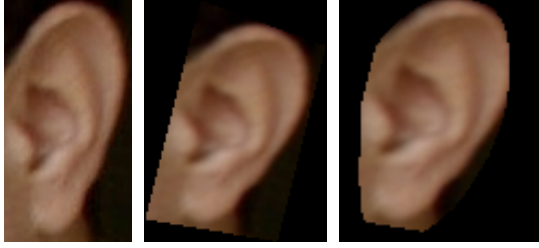
Figure 3: Images showing three stages alignment step before features are extracted.