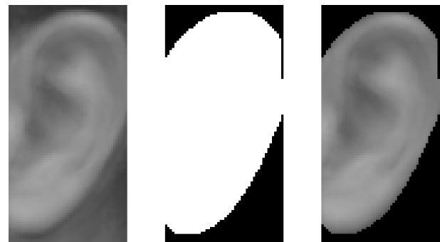
Figure 2: First two images show average ear and mask, respectively, the third image shows the resulting image after mask has been applied.

All images in our alignment procedure are aligned to an average ear. The average ear is acquired by summing and averaging all pixels of all images, which are annotated as perfectly aligned – meaning that roll, pitch and yaw axis are close to 0^\circ and they are not occluded or contain accessories. Because all ears in AWE are annotated, we had the information if ear contains any accessories, if ear is overlapped and most importantly if ear is already in normal position, and if not, on which axis. Left average ear was summed using 26 and right was summed using