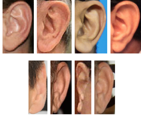
Figure 5: Four images in the first line have significant pitch angles and negligible roll and yaw and present the easier dataset (subset I) for ear alignment. Four images in the second line have all angles significant and present the more difficult dataset (subset II) for ear alignment.

The results on the subset I show improvement of aligned ear images over non-aligned ear images with Rank-1 recognition rate of 72.8% vs. 66.3%. Equal Error Rate (used in verification setups) reduced from 27.65% to 24.45%,